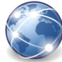
Le vote par internet